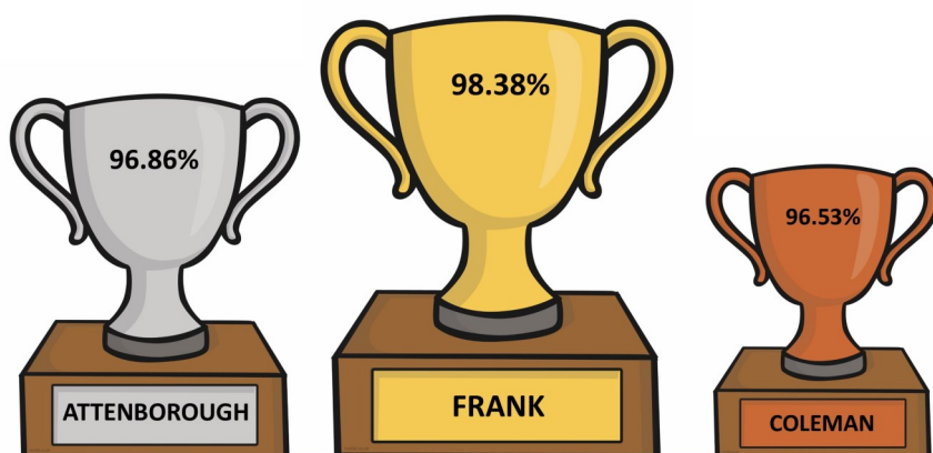
Attendance for the AUTUMN TERM